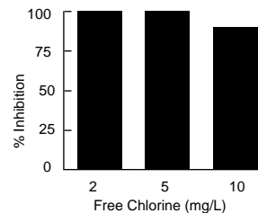
Figure 2: Stability of 10 mg/L AEC at High LSI in the Presence of Chlorine

AEC technology is a major breakthrough in calcium carbonate scale control. Figure 1 demonstrates the ability of AEC to inhibit calcium carbonate scale compared to other conventional inhibitors.